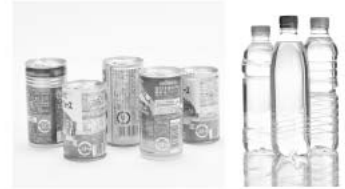
cans and plastic bottles (缶とペットボトル)

Mr. Brown: I hear there are some problems about Ooho, too. For example, Ooho is not as hygienic as plastic bottles. But I think Ooho can be a useful way to carry water. If we start to use Ooho, we can reduce plastic bottles.